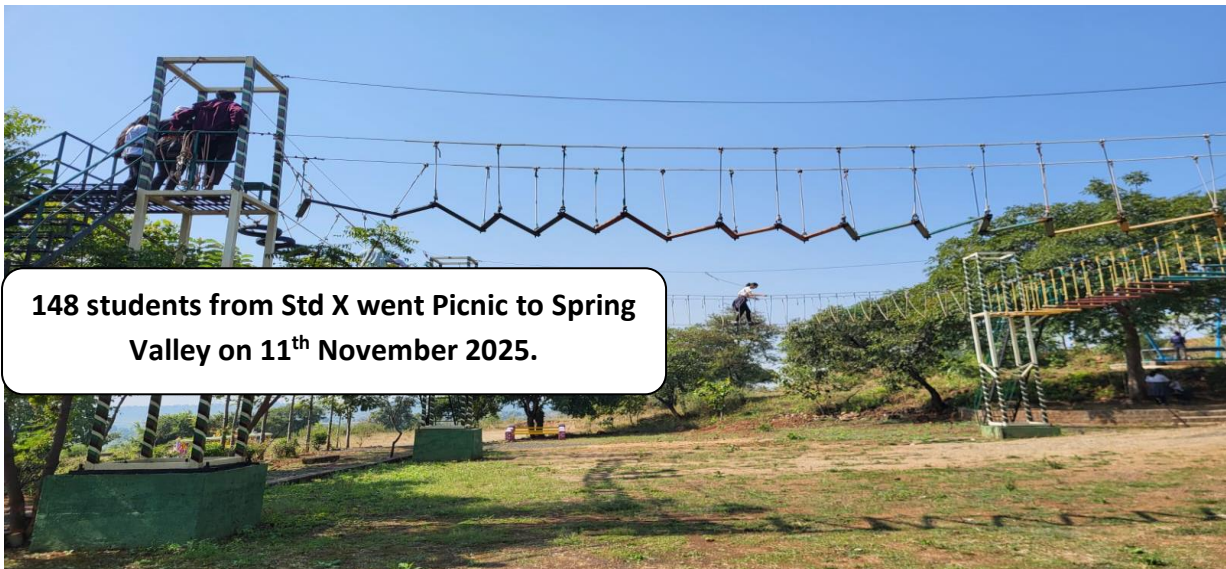
148 students from Std X went Picnic to Spring Valley on 11 th November 2025.