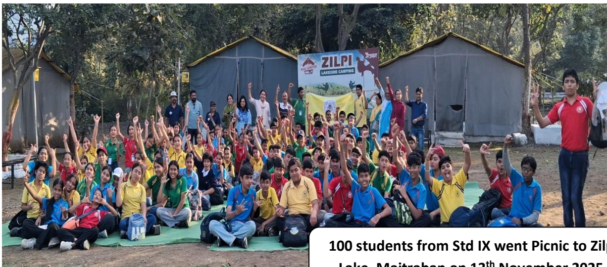
100 students from Std IX went Picnic to Zilpi Lake, Maitraban on 13 th November 2025.