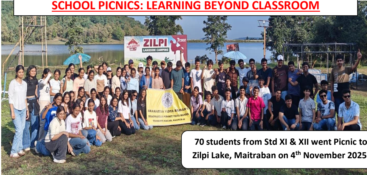
70 students from Std XI & XII went Picnic to Zilpi Lake, Maitraban on 4 th November 2025.